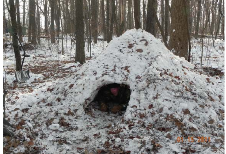
more pictures are available on the Troop's website